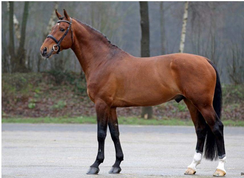
Casaron (Ginus x Zichem x Irak x Simon Bolivar x L'invasion x Graaf van Wittenstein)

Bottom right: ( Folio (Wachtmeester x Tamboer x Baronet x Nubert x Grootmeester x Colonel (Mentor)))